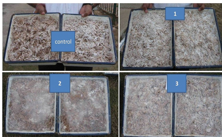
Figure 2 Growth pattern of Ganoderma sp. on raw wheat straw and tannin free ssf treated wheat straw (TFWS) Control: raw wheat straw; 1: TFWS treated with 0.1% tannase; 2: TFWS treated with 0.2% tannase; 3: TFWS treated with 0.3% tannase.

resources in nature, particularly to dispose of organic waste, using clean technologies. Every year, large quantities of cellulosic agriculture byproducts are being produced. In the face of global industrialization and the subsequent environmental consequences, as exemplified by the decline in forest belts and global climate changes, forces us to consider the potential benefits of finding alternative sources of cellulose. To date, WS is rarely used for cattle feed because of its relatively low nutritional value, particularly the low protein content, high fiber content, and low digestibility by ruminants. Thus, improvements in the nutrient availability in cattle feed presents a significant challenge to animal nutritionists.