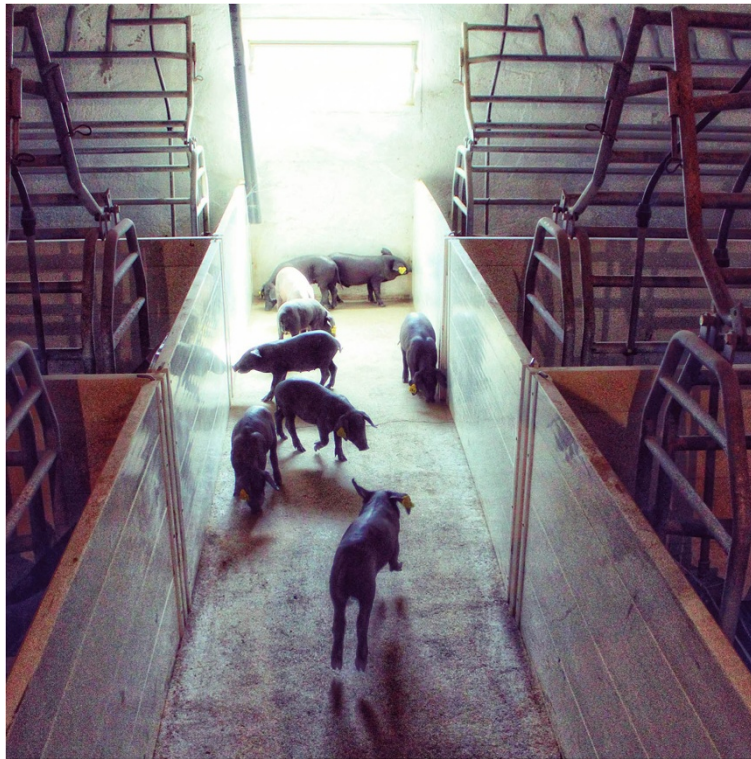
Figure 1 Experimental setup and example of a piglet displaying locomotor play.